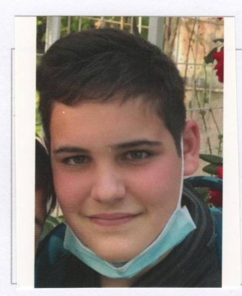
Country of Citizenship * Spain