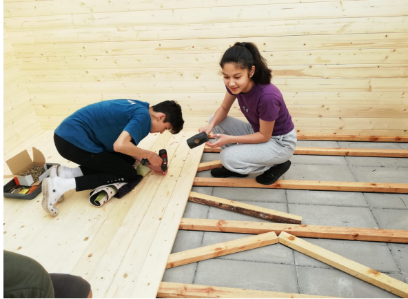
Here you can see my sister and me building our summerhouse.