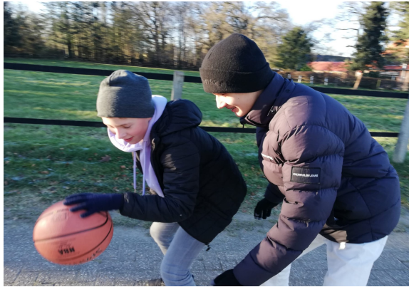
Here you can see me and my cousin playing basketball.