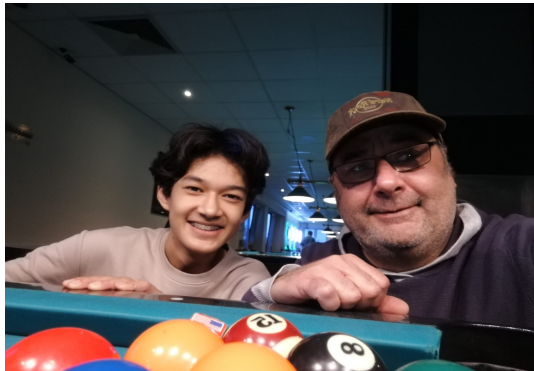
Playing 8-Pool-Ball with my Dad is fun too.