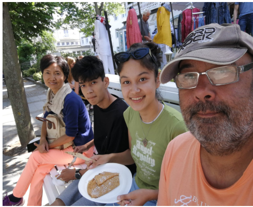
This was our trip to an Island called Rügen.