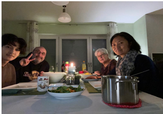
This is, waht our christmasevening looks like; having food with my grandmother.